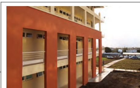
Mauritius Campus – 2009