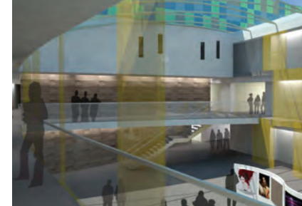
Art, Design and Media programmes building – opens in 2011