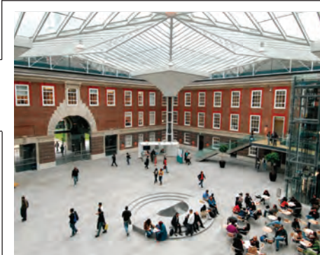
The Quad in College Building – 2005