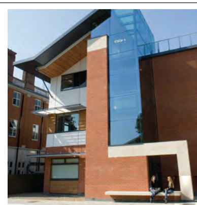
Hatchcroft – 2008