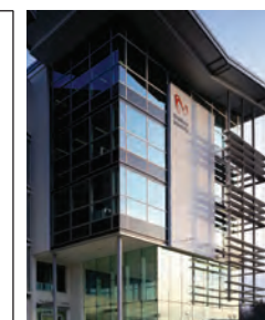
Sheppard Library – 2004