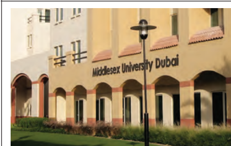
Dubai campus – 2005