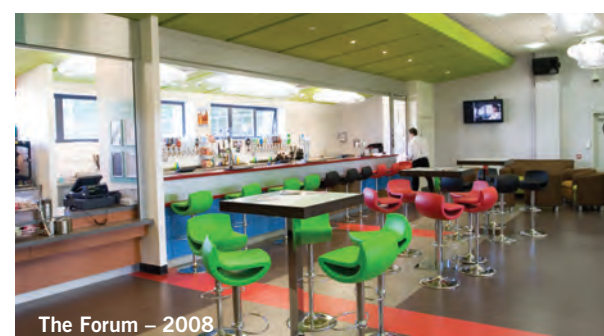
The Forum – 2008