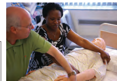
Whittington Hospital – 1998

Brand new home for Art, Design and Media programmes at Hendon campus to open